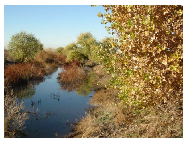
Riparian habitat is developing along the first half mile of the old river channel at Rio Bosque. Photo: December 14, 2013.

Once the 2014 irrigation season begins, these flows will end; the park will again be largely dry. But as the year progresses, that could change. The new turnout is performing well. If we identify waterrights holders willing to assign irrigation water to the park, the turnout makes delivery of that water possible. Also, at its Nov 13 meeting, El Paso's Public Service Board gave EPWU the go-ahead to put the planned pipeline from the Bustamante Plant to the park out for bid. Once built, the pipeline will enable water deliveries to the park year-round. X